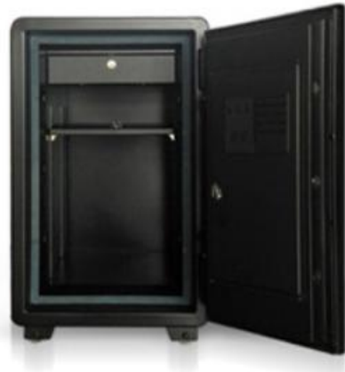
암고 운영시스템 비교